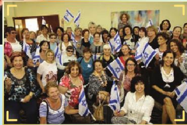
A fortifying and empowering mother's get-together